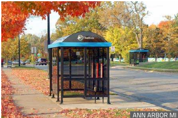
ANN ARBOR MI