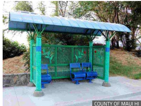
COUNTY OF MAUI HI